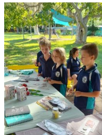
This year's P&C Mothers Day stall was a great success—thank you P&C for supporting our children in this way.